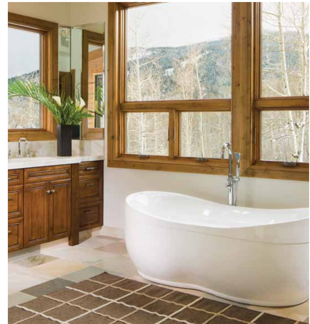
USUAL SUSPECT Windows above the freestanding bathtub allow natural light to flood the spa-like master bath. Rather than an expected mirror above the vanity (by Carbondale Custom Cabinets and Trim), a large window instead frames the views.